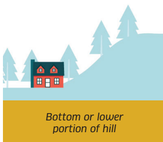
Bottom or lower portion of hill