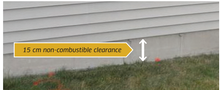
HAZARD FACTOR 7: GROUND TO SIDING CLEARANCE