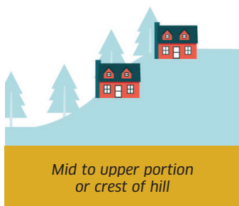
Mid to upper portion or crest of hill